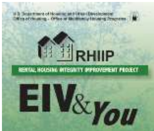
“EIV and You” Brochure